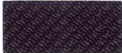
Sea Urchin 2